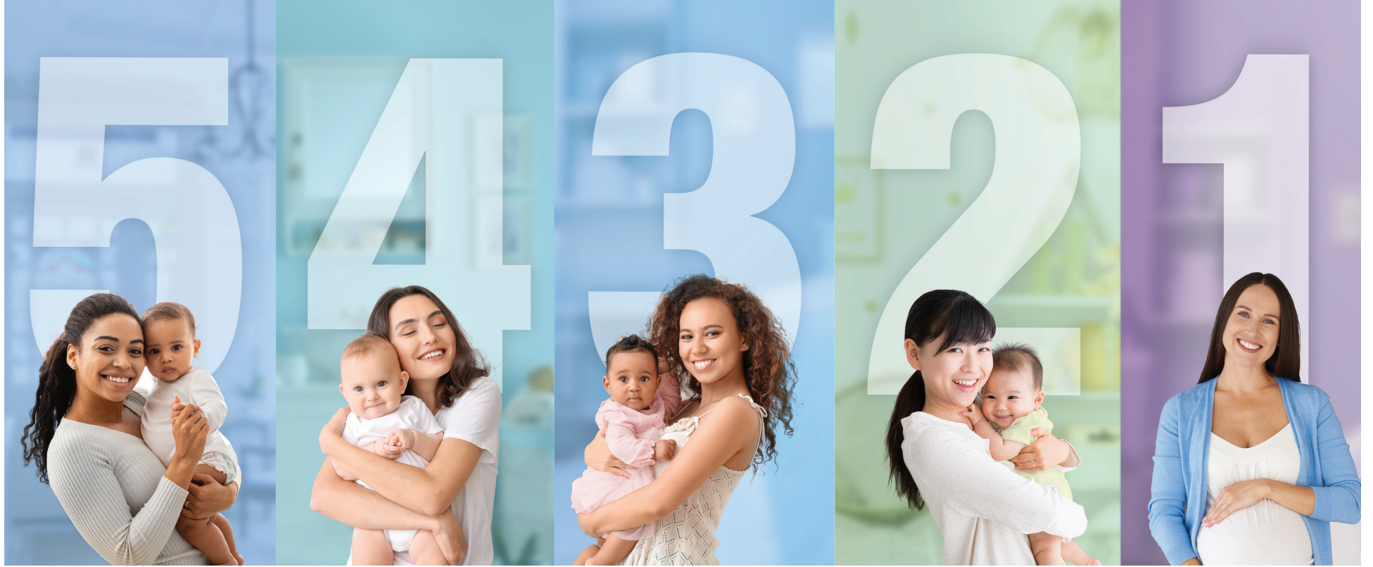
Stock Photos. Posed by models.